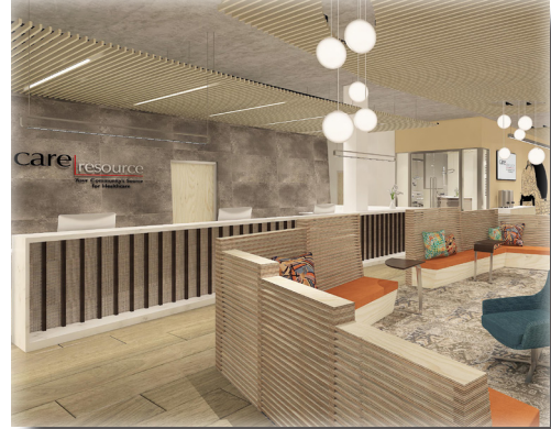
Artist rendering of the proposed interior of Care Resource's Midtown Miami facility.

This project significantly impacts the Care Resource patient experience, service capacity and broader community and neighborhood. It will allow Care Resource to serve an additional 52,000 patients through 98,000 additional visits by the end of 2026, and create an additional 257 full-time staff positions, totaling 508 . Upon completion, in addition to an in-house pharmacy, medical, dental and behavioral primary care services, the new location will also offer case management, patient outreach, HIV/AIDS early testing and intervention as well as a food bank. The facility will serve low-income minorities, recently arrived immigrants, at-risk populations, elderly, LGBTQ adolescents/adults, and the residents of the Miami-Dade area.