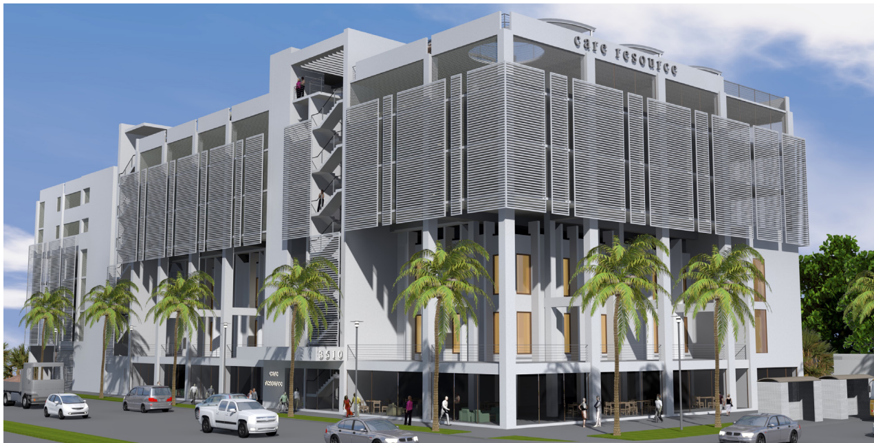
Artist rendering of the proposed 55,000 square foot Care Resource Midtown Miami headquarters.

According to the 2018 Florida Department of Health Surveillance Report, 119,661 Florida residents live with HIV/AIDS, and of those, 21,048 reside in Broward County. In the last ten years, Miami-Dade County has seen a 53% decrease in AIDS diagnoses and four-percent decrease in HIV diagnoses. Nearly all widely-used anti-retroviral drugs used today were studied by Care Resource (formerly CRI)'s clinical research program, which pioneered the implementation of community-based clinical trials in 1989.