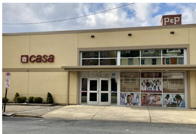
The current NHCLV Allentown site, before the renovation and expansion project.

The health center was founded by a group of local residents concerned about the community's obstacles in getting routine and preventive primary care services due to language and transportation barriers, and extreme poverty.