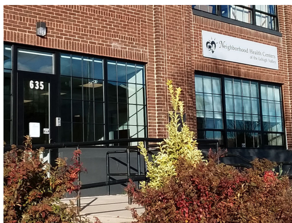
Exterior of the new Northside Bethlehem location.

This site will also include 10 additional medical exam/consultation rooms, two behavioral health offices, one group visit room/consult room suite, one triage room, a larger dental suite than at the health center's Hamilton, PA location, and offices for case management, care management, billing, administration, and other support services for the staff.