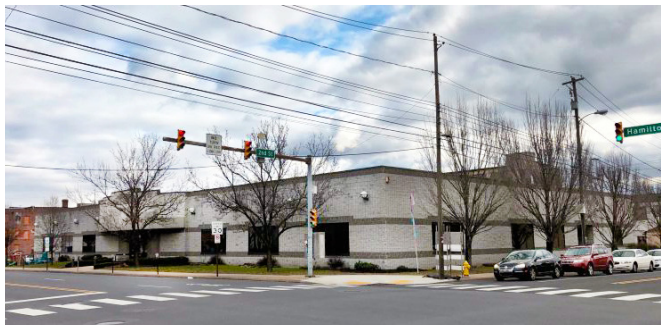
Exterior of the new Allentown building site.

For its Allentown, PA renovation, NHCLV will renovate and expand the first floor of an existing 14,200-square-foot retail space into a 27,200-square-foot health center site. The construction will add 15 medical exam/consulting rooms and three behavioral health offices, along with two procedure rooms, one group education room, two triage rooms, a larger pharmacy, a dental suite and offices for case management, care management, a call center, and support services for the health center staff.