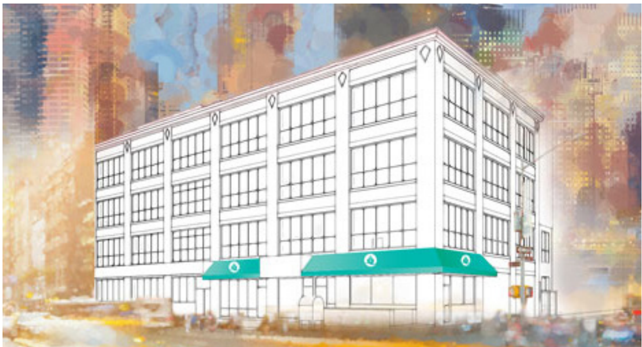
Artist rendering of the nearly 30,000-square-foot space in Long Island City, Queens TFH proposes to lease and relocate its main clinic site.

For 150 years, TFH has offered affordable healthcare services to those in need. Today, the historic hospital serves as a healthcare safety net to families throughout Northwest Queens, with two locations in Long Island City and one in Astoria. Since its inception, TFH has served 5 million New Yorkers.