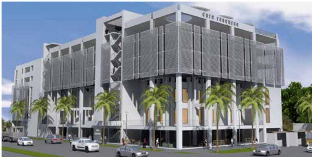
Artist rendering of the proposed 55,000-square-foot Care Resource Midtown Miami headquarters.

According to the 2019 Florida Department of Health Surveillance Report 3 , 116,689 Florida residents live with HIV/AIDS, and of those, 21,048 reside in Broward County. In the last 10 years, Miami-Dade County has seen a 53% 3 decrease in AIDS diagnoses and a four-percent 3 decrease in HIV diagnoses.