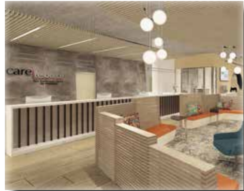
Artist rendering of the proposed interior of Care Resource's Midtown Miami facility.

This project significantly impacts the Care Resource patient experience, service capacity, and broader community and neighborhood. It will allow Care Resource to serve an additional 52,000 patients through 98,000 additional visits by the end of 2026, and create an additional 257 full-time staff positions, totaling 508 . Upon completion in early 2021, in addition to an in-house pharmacy, medical, dental, and behavioral primary care services, the new location will also offer case management, patient outreach, HIV/AIDS early testing and intervention as well as a food bank. The facility will serve low-income minorities, recently arrived immigrants, at-risk populations, elderly, LGBTQ adolescents and adults, and the residents of the Miami-Dade area.