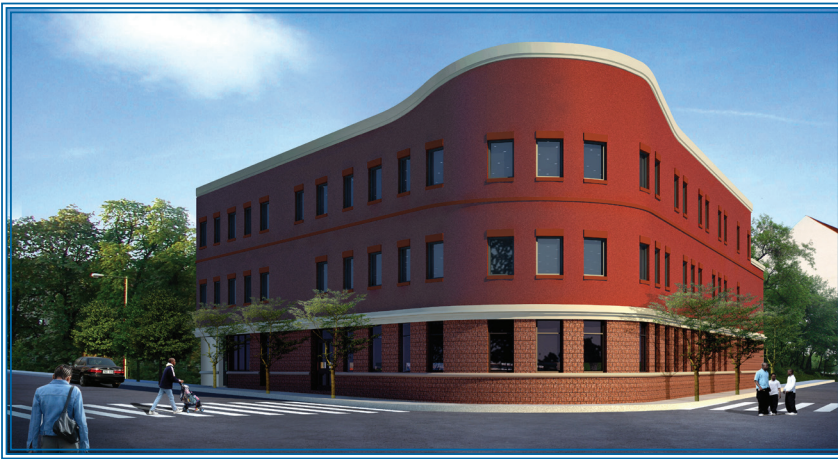
A rendering of the new facility

In June 2007, Spectrum Health Services purchased a facility at 52nd & Haverford Avenue, formerly known as the Nelson Medical Group, and designated this location as the site for the new “green” Spectrum Community Health Center. The energy sustaining features will include geo-thermal, solar, and water source heat pump systems while providing a more user friendly and patient-oriented facility.