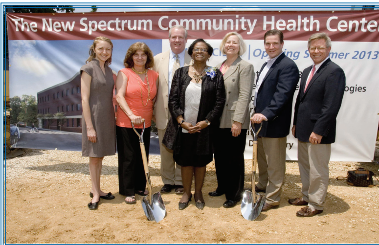
A ground-breaking ceremony was held in July, 2012

The new location is close enough to the Haddington Health Center that the existing patient base should have little difficulty in transferring and staff will not have to travel farther to work. It is located on a major bus line and will be accessible from all over the city. The opening of this new facility, planned for July 2013, will result in significant future growth for SHS and will enable Spectrum Health Services to better fulfill its mission to provide an affordable, welcoming medical home to the underserved population of West Philadelphia.