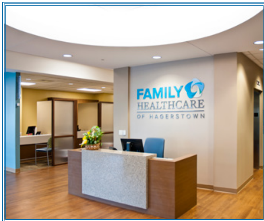
The reception area of Family Healthcare's new facility.

In 2014, Family Healthcare served over 6,600 patients. The vast majority earned less than 200 percent of the Federal Poverty Level and 66% percent were Medicaid recipients.